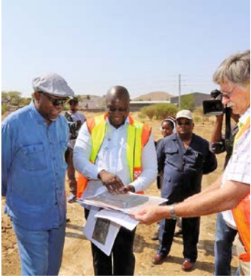
From stunning savannahs teeming with rich flora and fauna, to welcoming towns and cities, Namibia boasts a wealth of opportunity

send it back to us at higher prices. We are open to the mining of diamonds and the resources we have in order to create jobs here, and push for transfer of technology for domestic value addition."