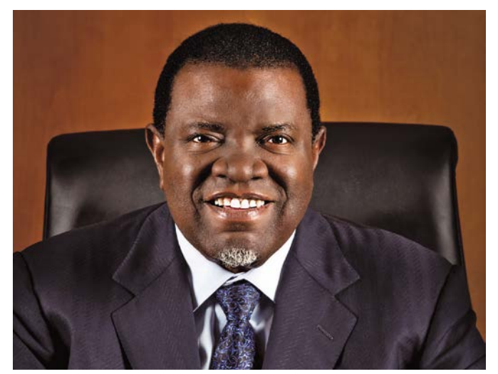
Hage G. Geingob, President of the Republic of Namibia

During the official opening ceremony, President Geingob said the $14 million facility boosted Namibia's national development aspirations and signified to the international community the country's intent to become a premier destinations for foreign direct investment (FDI) in Africa.