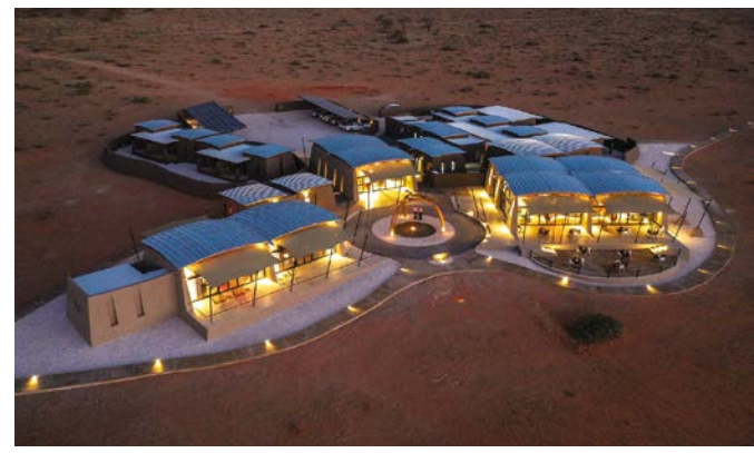
The stunning Desert Grace Lodge sits in the heart of the Namib Desert

We are dreamers and idealists, but firmly know that sustainability